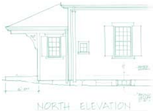
Architect's drawing of North Dartmouth Meeting House at its new location.