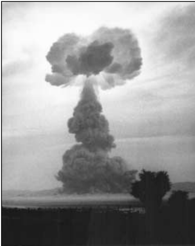
“Harry”, a 32-kiloton nuclear test exploded in May 1953 at the Nevada Test Site. The Harry shot resulted in the heaviest contamination of “downwinders” — civilians living downwind of the test site — of any U.S. continental explosion. 20