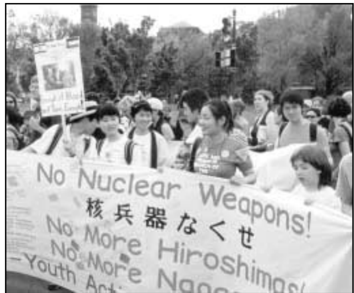
March on Washington, April 2002. The international community expects the U.S. and other nuclear powers to fulfill their treaty commitments to nuclear weapons abolition.

Sir Joseph Rotblatt, one of the fathers of the atomic bomb and the chagrined author of the concept of nuclear deterrence, reminds us that “the only alternative is the total elimination of nuclear weapons.” He is clear that “We have to convince the public that the continuation of current policies...is bound to result in a nuclear holocaust in